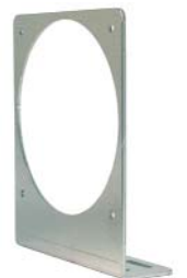
Fan Bracket A-BRKT4