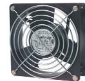
Cooling Fans A-4AXFN